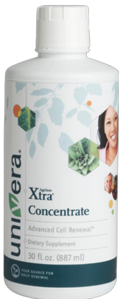
30 oz bottle Item# 100300