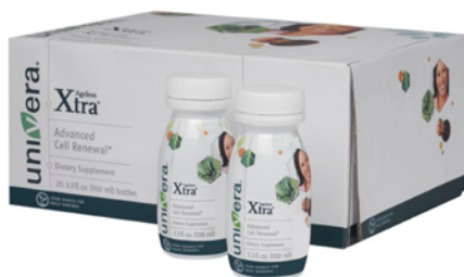
20 - 3.3 fl oz MINI bottles Item# 100305

*These statements have not been evaluated by the Food and Drug Administration. This product is not intended to diagnose, treat, cure or prevent any disease.